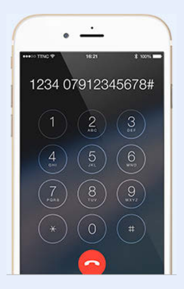
Enter the number you want to call, followed by the '#' key