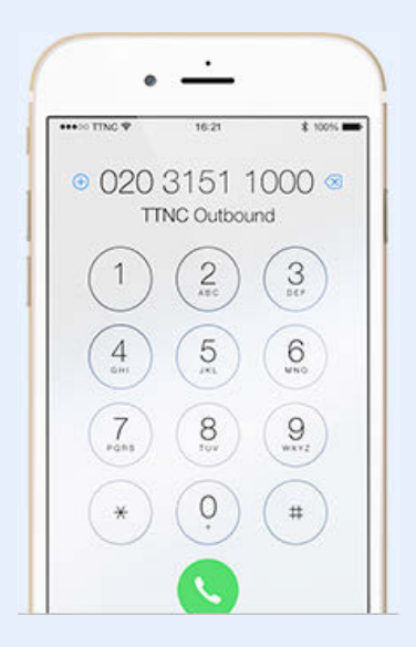
Call your virtual number from the registered handset