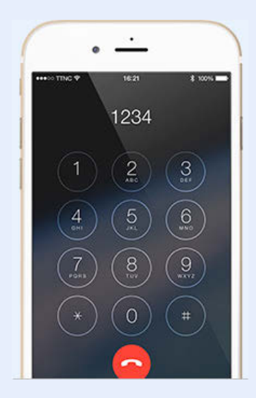
Enter your PIN code